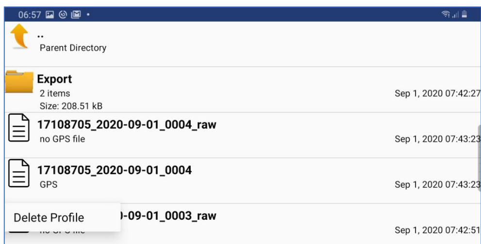
Figure 3 Delete option in file explorer

Note – when deleting a profile, all file associations for that specific profile will be deleted (i.e. .iprh, .iprb, .mrk, .cor, .gps, and .time).